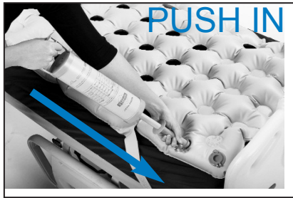
Open clear valve and insert pump toward the head of bed and inflate.

Each complete out and in stroke equals one complete stroke.