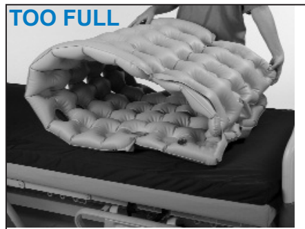
Has to be forced to fold in half.

Each complete out and in stroke equals one complete stroke.