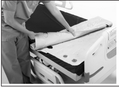
Valve on top and at foot of bed.