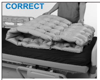
Mattress easily lays folded in half.